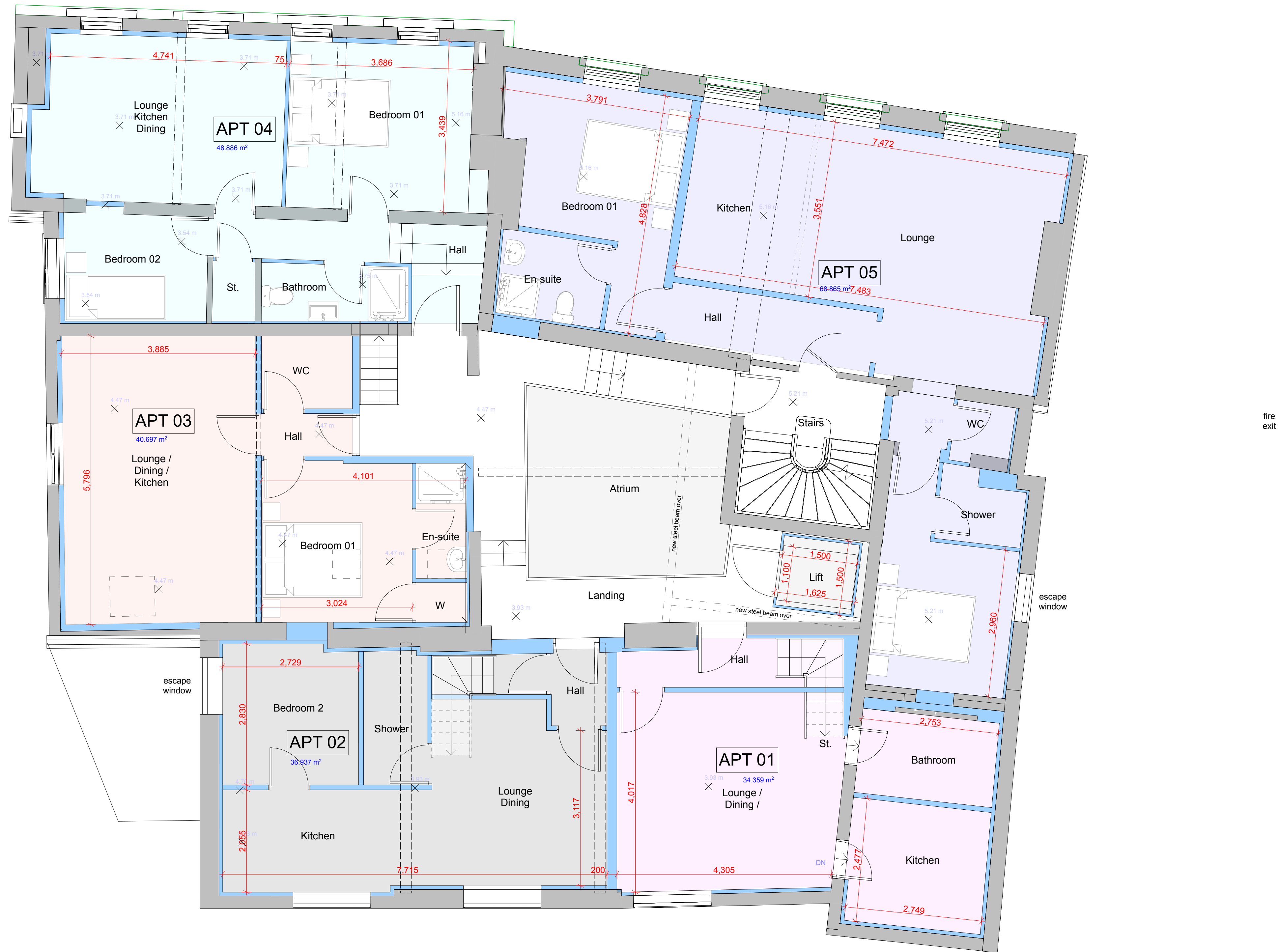
Level 02 - Proposed 2nd Floor Plan